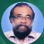
Prof. Dr. A. Hisham Endowment Award Function

Mar Ivanios College is an educational institution situated in Thiruvananthapuram, Kerala. The College is located on a small scenic hilltop with a sprawling campus area of hundreds of acres in Bethany Hills, Nalanchira. The College is the dream child of the Late Archbishop Servant of God Mar Ivanios of the Syro-Malankara Catholic Church. The motto of the College is 'Veritas Vos Liberabit' which means 'Truth shall Liberate You'. The College is a pioneering institution of higher education in Kerala since 1949 and has been reaccruited (Fourth cycle) with A+ grade by NAAC with 50th rank in NIRF-2022. The College was granted autonomous status by the University Grants Commission in 2014. The Chemistry Department started in 1957 and offers UG, PG courses and is an approved research centre of the University of Kerala.